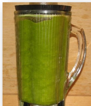
Super Green Juice